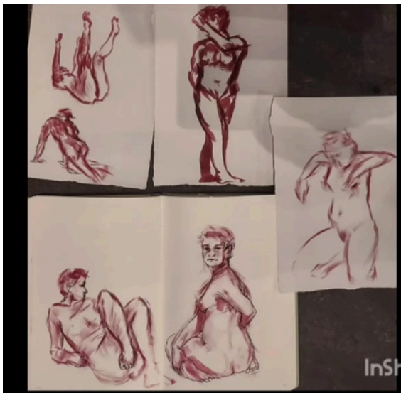
Bare Canvas 2-15 minute poses Artist: unknown