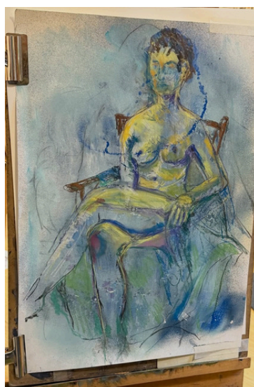
Sunnybank Mills 1 hour 30 minute pose Artist: unknown