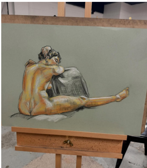
Leeds Drawing Club 40 minute pose Artist: @fern_sketchbook Insta