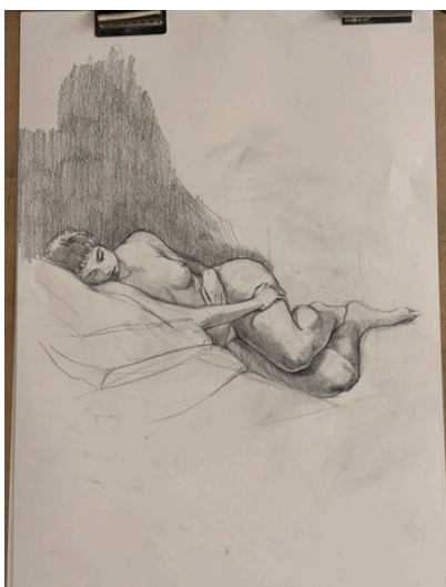
Leeds Drawing Club 2 hour pose Artist: unknown